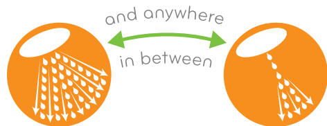
Oxygenics with Comfort Control